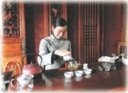
Armchair Travel Series China, Ireland, Norway, New Orleans, France