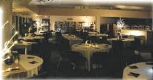
Ring in 2017